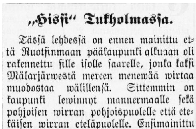
Fig. 1. A part of an article in the newspaper Turun Lehti published on the 14th of March, 1885

The National Library of Finland has a digital archive of historical newspapers ( http://digi.lib.helsinki.fi/sanomalehti/secure/main.html ), that consists of over 900,000 pages of old newspaper material. The archive includes every newspaper published in Finland during the years 1771–1890. The newspapers have been microfilmed and then turned into text using OCR methods specially designed for the old character set, the German ‘Fraktur’, used in the newspapers in the 18th and 19th century. Figure 1 shows an example of the text. The article’s title is “Hissi Tukholmassa” which means “Elevator in Stockholm”. In the original paper the article is completed with a painted picture of the elevator.